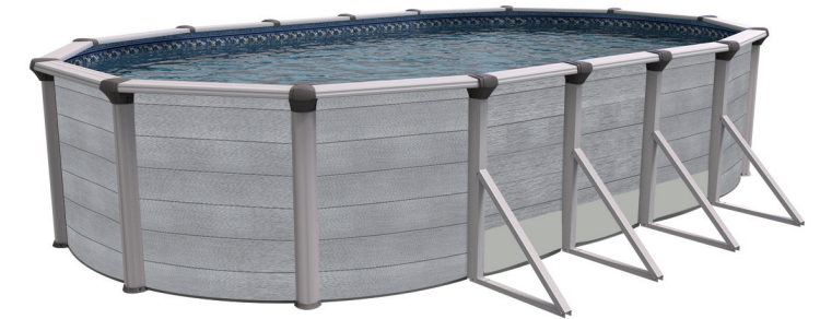
Magnum wall shown