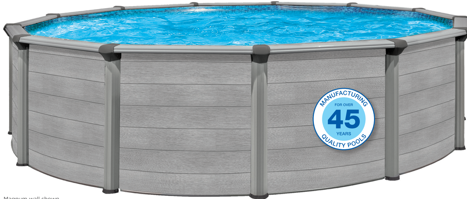
Magnum wall shown