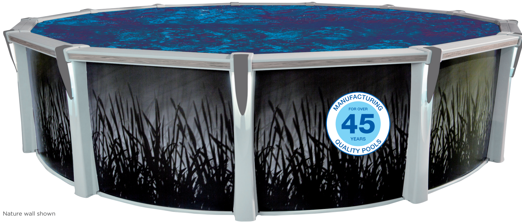
Nature wall shown