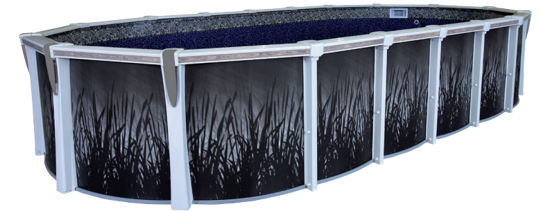
Nature wall shown