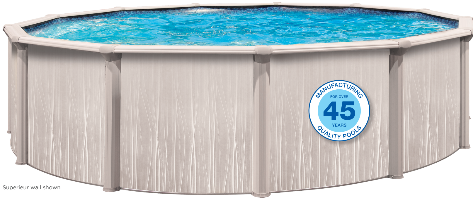
Superieur wall shown