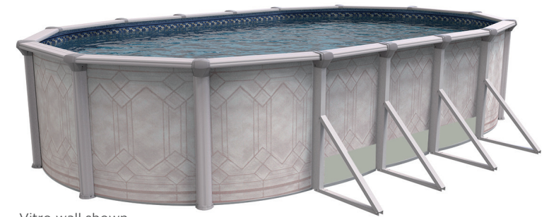
Vitro wall shown